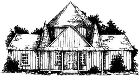
Pine Castle Historical Society Celebrating Old Florida