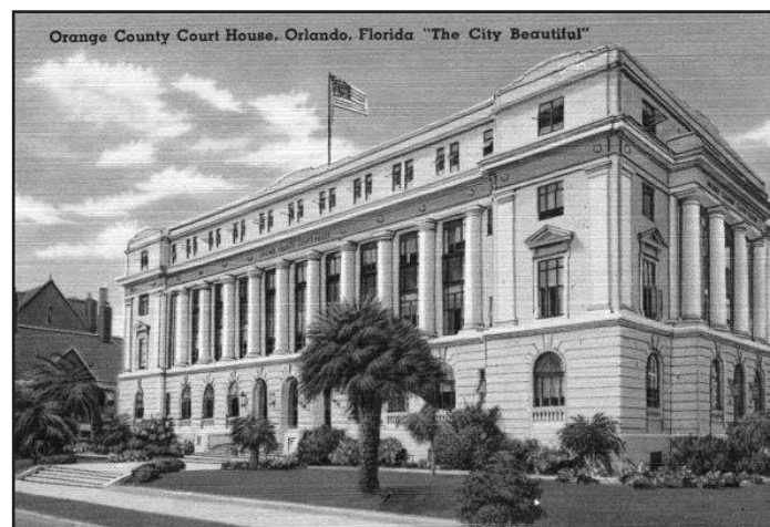
OC 1927 Courthouse, now the Orange County Regional History Center.